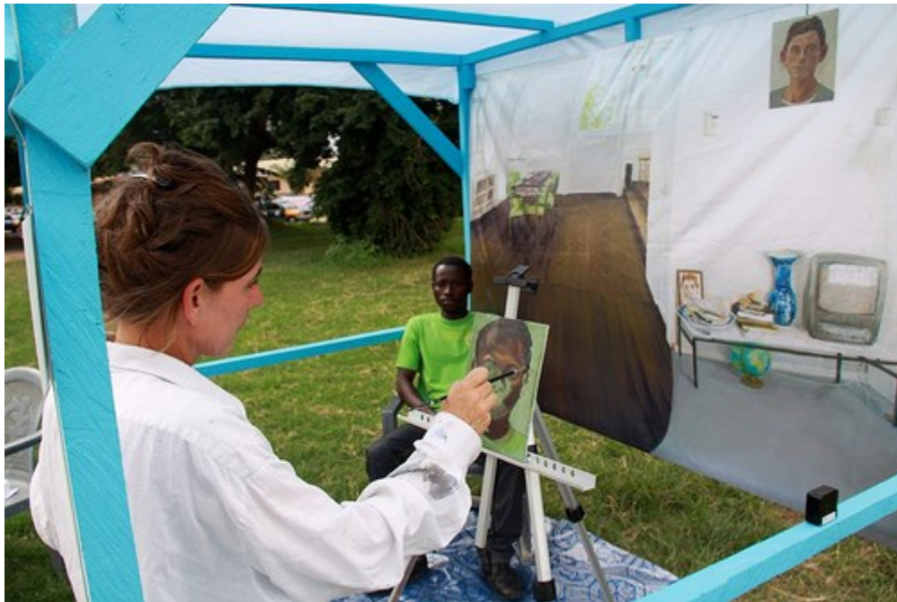
Portrait Shop by Brigitte Mulders, The Netherlands (portrait painter)

For additional information on the 2009 Kumasi Curio Kiosks, see: