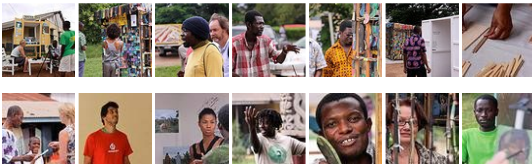
Photos from the 2009 Kumasi Curio Kiosks

Thus, we invite individual or group submissions for community theatre, media arts, readings, film screening, slide shows, open studios, visual activism, musical performances, community design, social architecture and others to allow the rural community to become acquainted with international contemporary artistic practice. Project is open to only serious applicants; submissions will be reviewed until July 8, 2011. Submit your curio kiosk proposal (sketches/description) to info@nkafoundation.org and/or nkaprojects@gmx.com . Project web site is www.nkafoundation.org . And we seek as we go, nominations for the Project Curator and an expert in filmmaking/media arts, to do the DVD and create the e-publication.